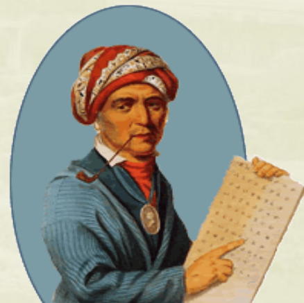
Oklahoma Library Association Sequoyah Book Awards

listed on book master lists are available for checkout.